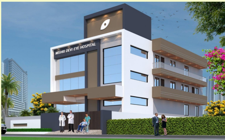
TAPUKARA (BHIWADI) UNIT